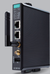
UC-8100 Wireless Computer

A: More sample applications especially with respect to interface to monitoring equipment